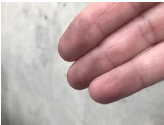
Dirt on hand after I wiped the DIRT off