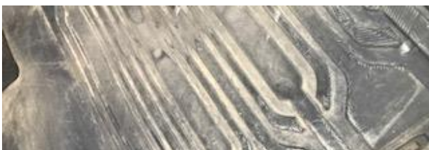
Inside truck floor