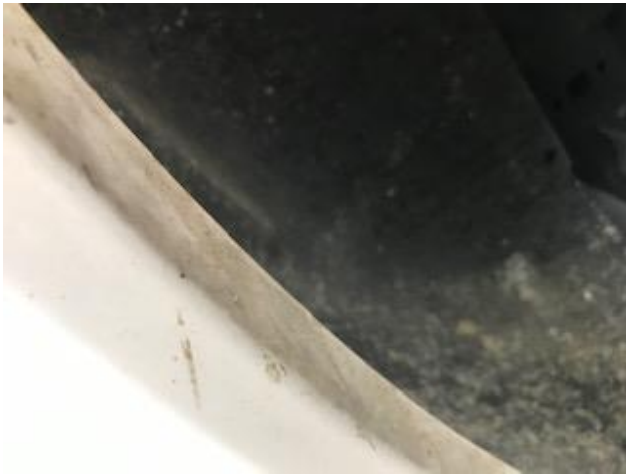
Dirty Truck Fender