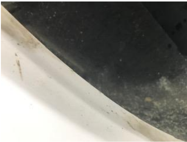
Area wiped with my hand.