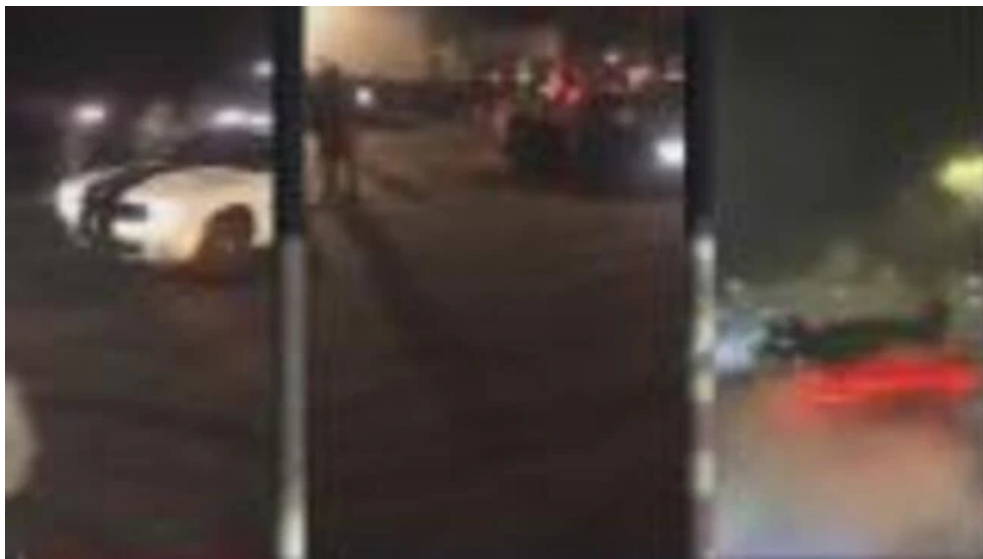
The penalties for street racing in Florida could be increased if a lawmaker has his way. Currently street racing...